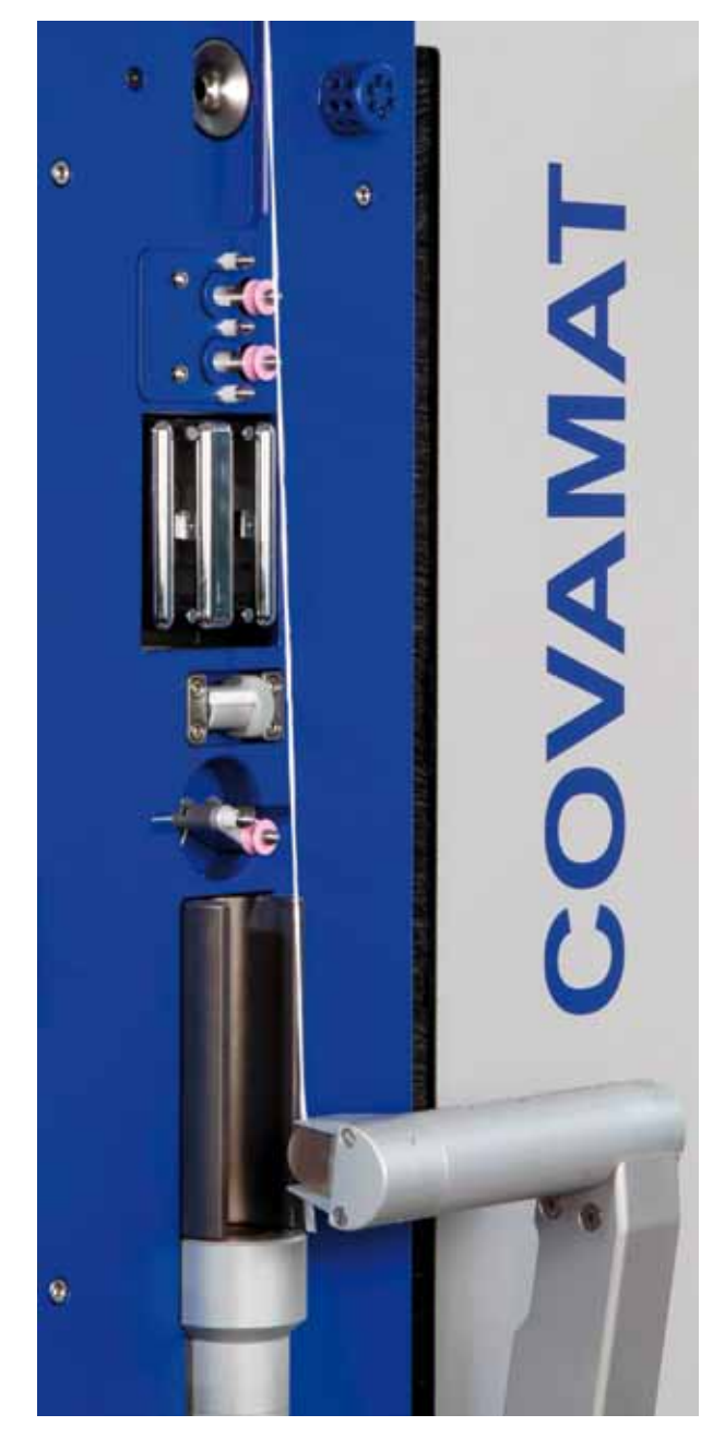
Sensor with Twister