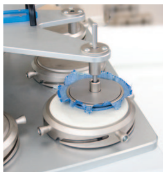
Example of 1-position sample holder with Ø 90 mm