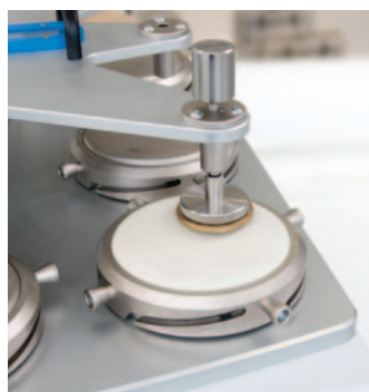
Example of 1-position sample holder for socks & hosiery