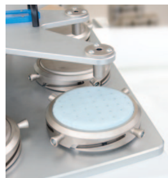
Example of 1-position sample holder for leather and coated fabrics