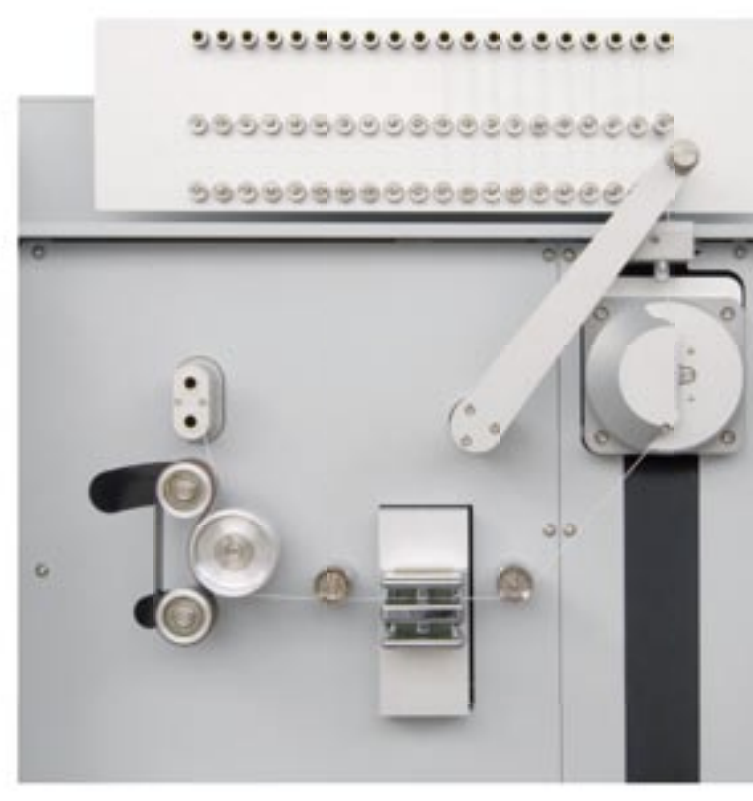
Yarn evenness and count test

Another advantage is the yarn tension measurement during the test. If tension limits specified by the relevant standards are exceeded, a correction is automatically made based on the same yarn's tensile properties.