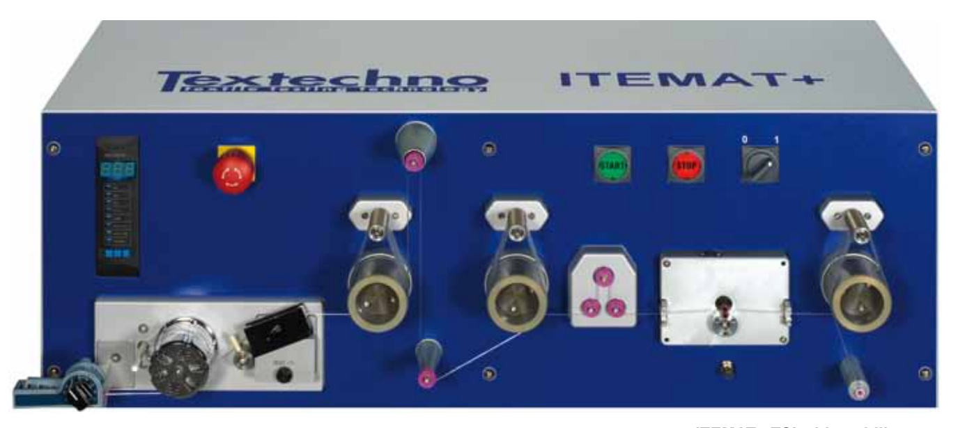
ITEMAT+ TSI with stability test in a single position housing

All ITEMAT+ versions are equipped with an active constant tension feeder at the yarn inlet to provide a precise pretension. This feeder compensates differences in yarn tension of the incoming yarn, which might influence the sensor reading.