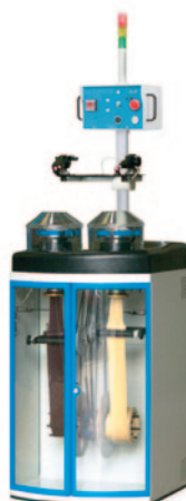
Double Lab Knitter code 294F