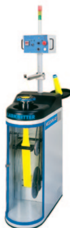
Lab Knitter code 294E

High speed fully automatic model for 24 or 36 bobbins. Especially suitable for texturizing mills. It includes: Auto Cop Changer for 24 or 36 bobbins, electronic yarn feeder, electronic yarn pretension device, knot detector and yarn guide frame.