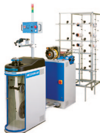
Dye Scanner code 2940A-B