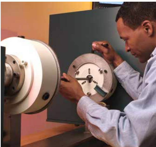
Samples are easily mounted in the patented bidirectional grips.