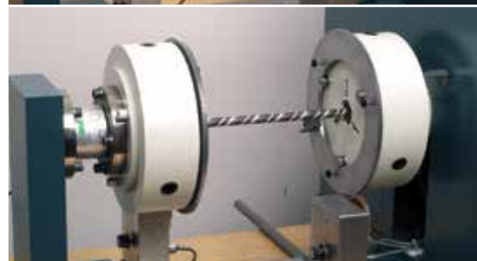
Top to bottom: A test in progress on the 10,000in.lbf model with a painted sample rod of steel.