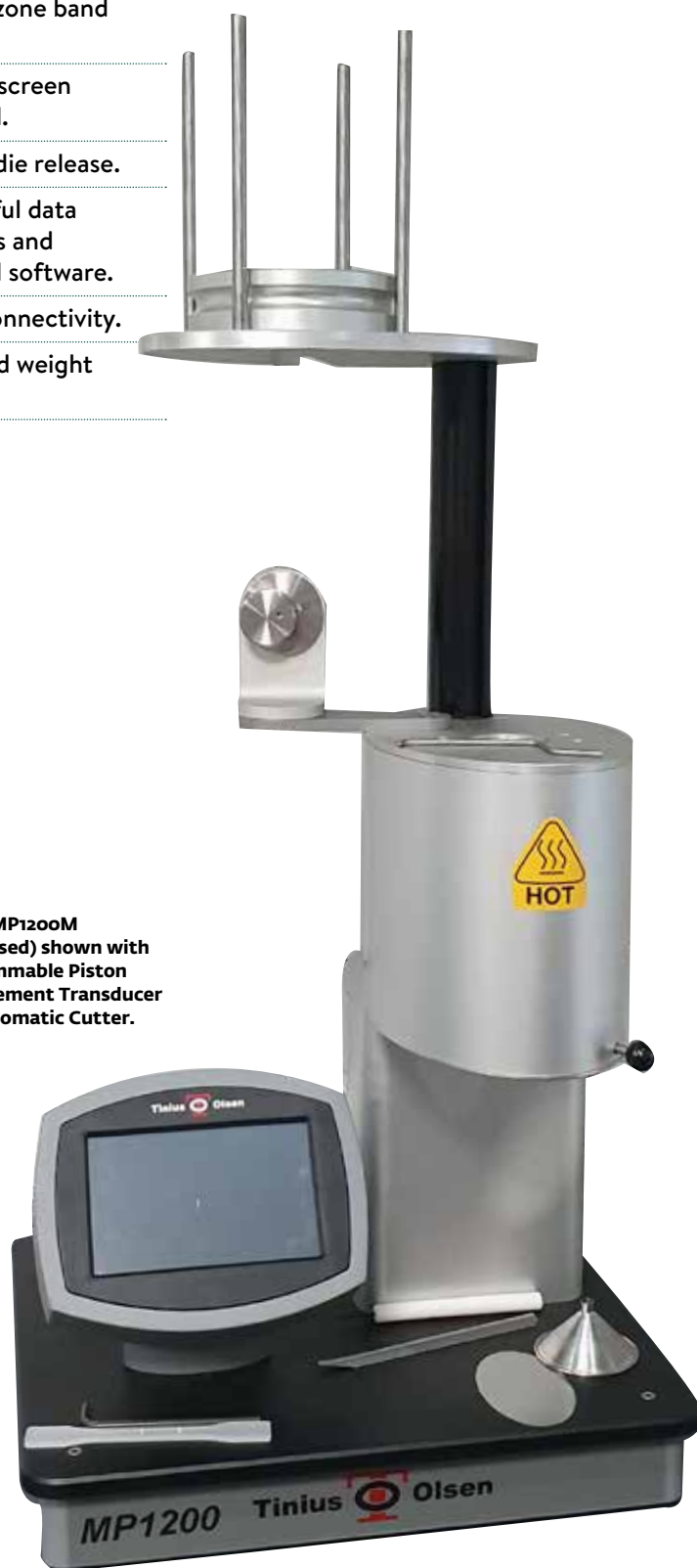
Model MP1200M (motorised) shown with Programmable Piston Displacement Transducer and Automatic Cutter.