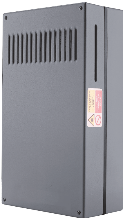
Model 500LC scanning laser extensometer.

Marking the test specimen with gauge marks is easy using two pieces of self-adhesive reflective tape (supplied) no less than 2mm in width. Any gauge length size maybe defined, minimum 10mm, this is accurately measured and automatically recorded by the extensometer at the start of the test. Once the test starts the instantaneous strain is automatically captured using the scanning laser at a scan rate of 320 times per second (320 Hz). If the scanning beam is interrupted for any reason, strain measurements are automatically corrected and continued when the laser beam is clear and picks up the gauge mark targets.