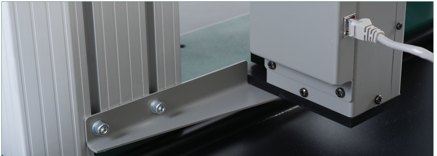
Model 100R long travel extensometer machine mounting detail.