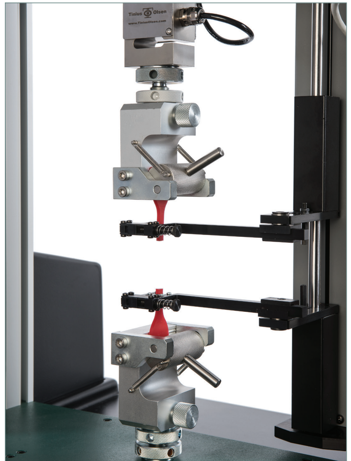
Model 100R long travel extensometer on specimen at specimen break.