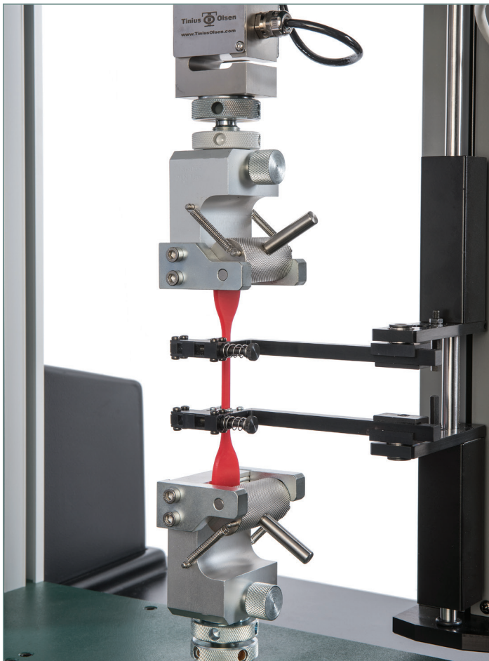
Model 100R long travel extensometer on specimen.